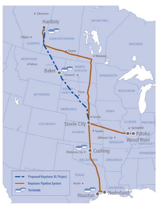
Figure 1: Keystone XL route map

Former ExxonMobil CEO Rex Tillerson was narrowly approved by the Senate to serve as Secretary of State, giving him the task of approving TransCanada's permit consistent with "the national interest" and all applicable laws.